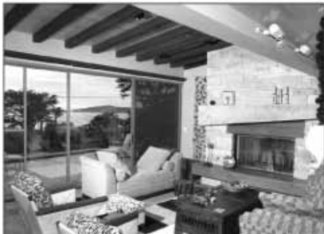
The windows of this Carmel Point home frame a spectacular view from the comforts of the warm living room.

Dolores St. SW of Ocean Avenue • Carmel-by-the-Sea • 625-2420