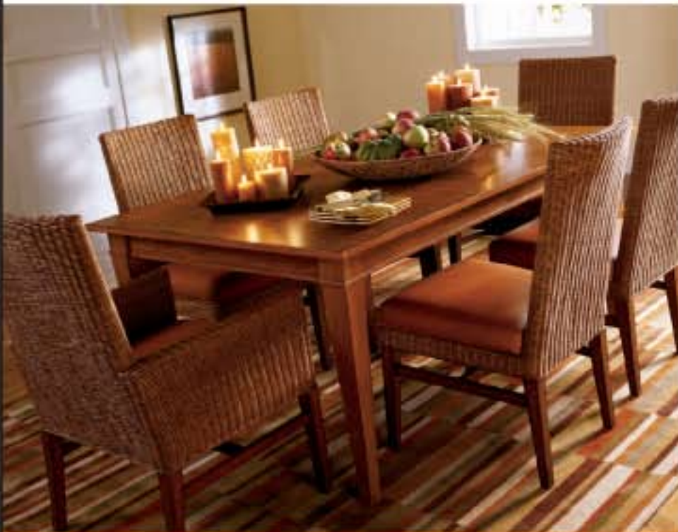
rectangular dining table $899 rattan side chair $399 ea. rattan armchair $449 ea.

With our complimentary design service, everyday best pricing, and affordable financing options, now is the perfect time to visit.