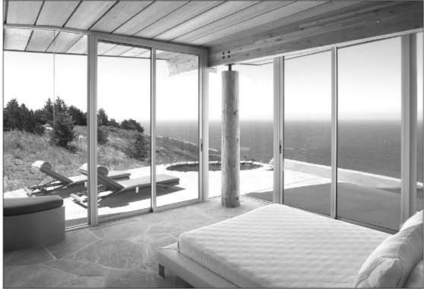
Expanses of windows in Langka and Zach Treadwell's Big Sur home showcase the beautiful coastline, while the modern interior is simply crisp as well as comfortable.