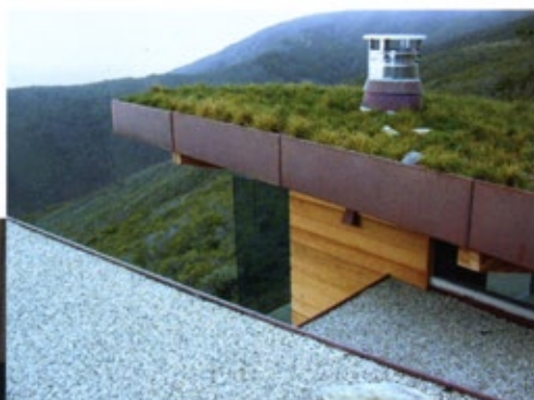
The sod roof on Rob Carver's home.

The epitome of green architecture for Carver was a recent Carver & Schicketanz project in the middle of an environmentally sensitive California redwood canyon that required builders to laboriously hand-dig the foundation to avoid interfering with nearby tree root systems. The finished house floats about two feet above the ground on narrow steel beams. The wood used for the structure was "old growth," meaning that redwoods that fell in the forest by natural means—but had not yet begun to rot—were harvested for the lumber. The finished house was encased in a steel skin that was designed to be evocative of redwood bark. Inside, the home is decorated with all natural fiber carpets and nontoxic paints. It also includes nifty engineering innovations such as a garage that employs a lift and turntable design in order to stow three cars in what appears to be space for only one, as well as an automatic fire spray system that temporarily protects the house in a region vulnerable to conflagrations.